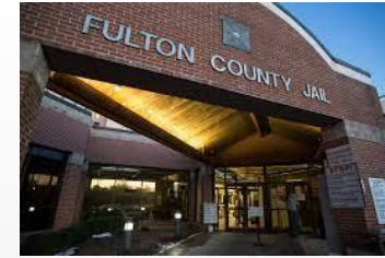
Fulton County Jail