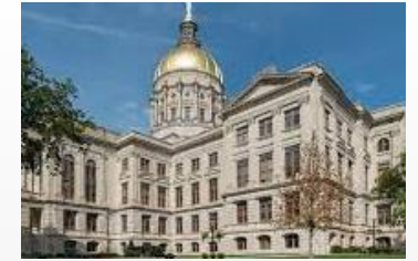
Strong Gang Legislation at the Capitol