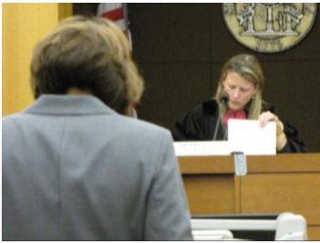
City funded prosecutors