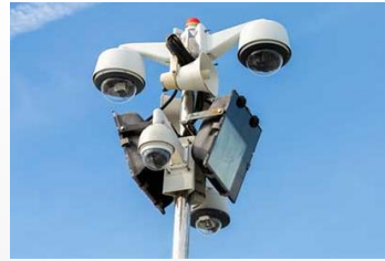
Crime Fighting Technology for DA, APD and Sheriff