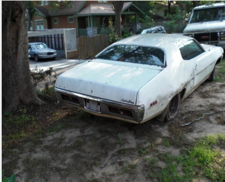
Missing license plate and flat tire