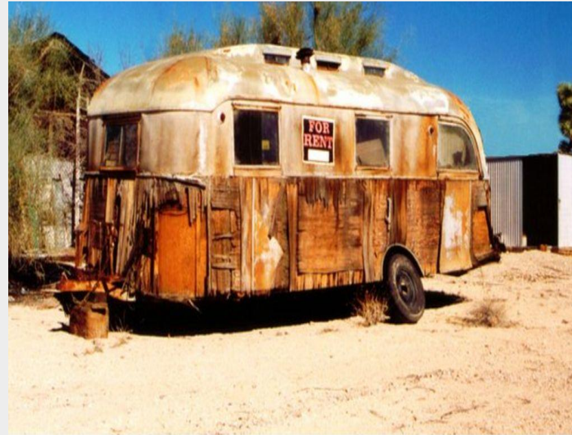
Inoperable, wrecked, discarded, abandoned mobile home