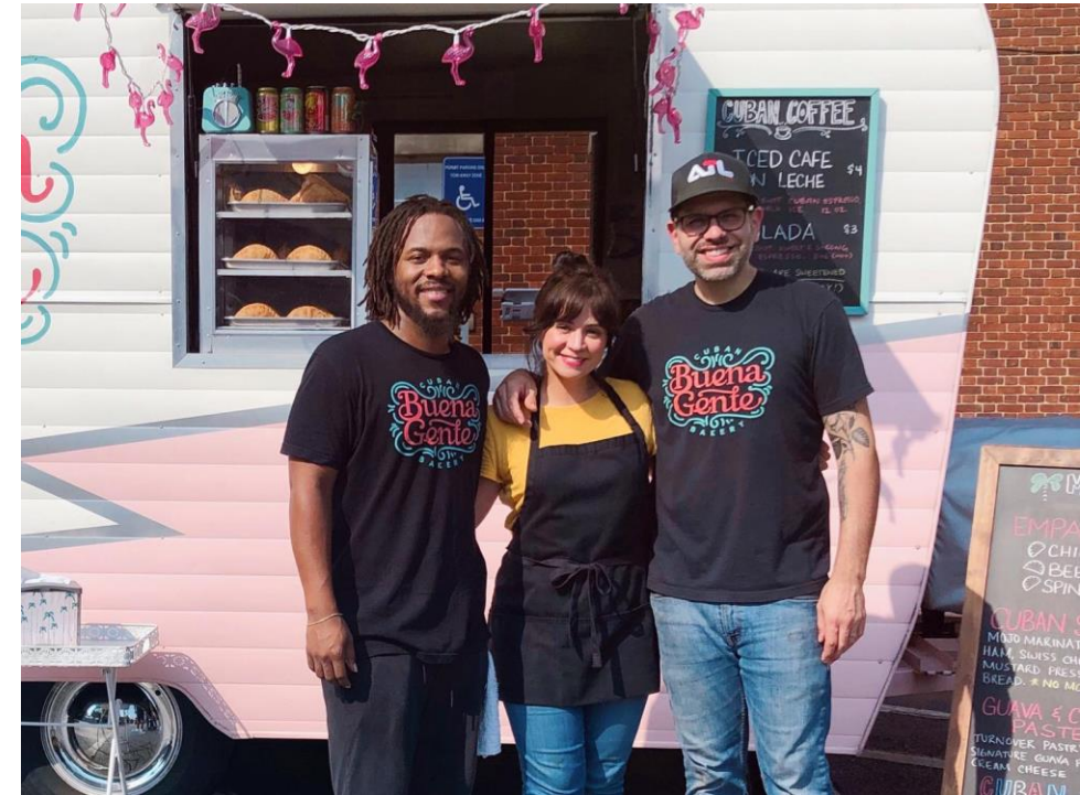
Buena Gente Cuban Bakery Food Truck