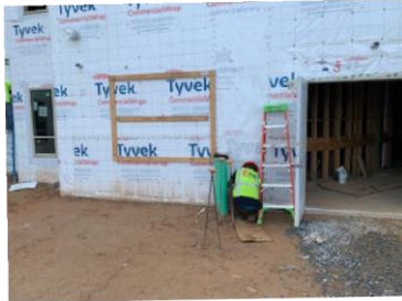
Exterior - taping of seams (Tyvek weather wrap. Placement of Ardex, bathrooms