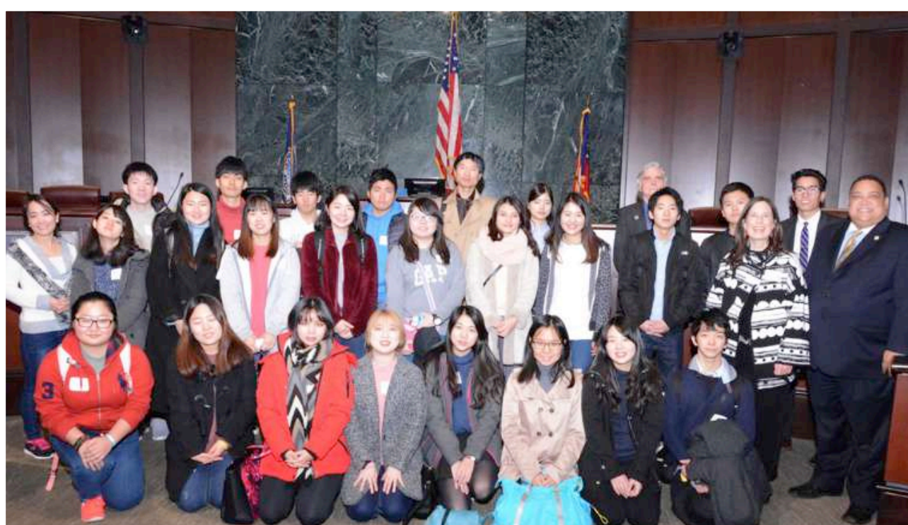
Atlanta Ministry With International Students visited Atlanta City Hall on Monday December 19, 2016