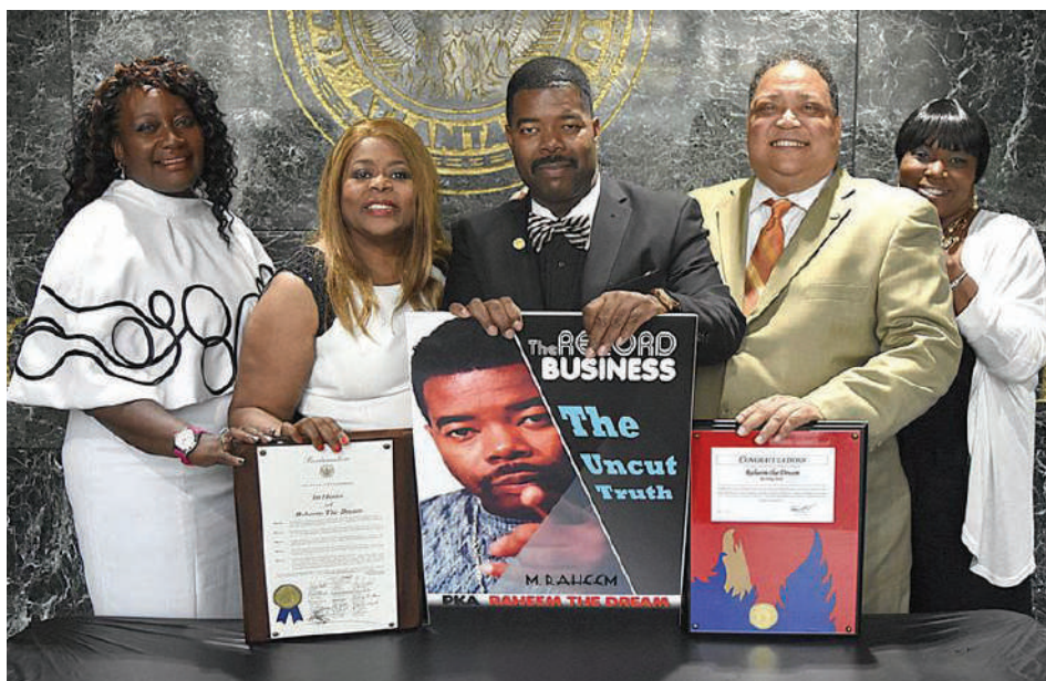
Raheem The Dream Day at City Hall

Atlanta's own 911 Band opened the show, followed by A Taste of Honey, Lakeside and headliner Parliament-Funkadelics/George Clinton.