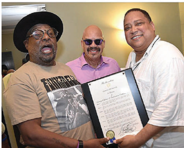
Honoring George Clinton with KISS 104.1's Tom Joyner at Flashback Festival