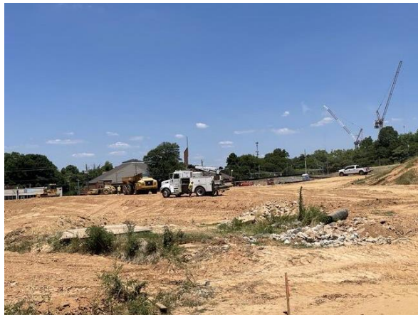
Herndon II 170 Affordable Units | $77,976,398 TDC District 3