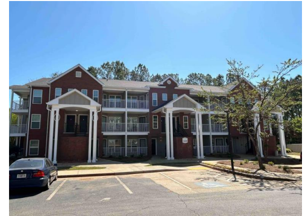
Villages at Carver I 110 Affordable Units | $46,035,837 TDC District 1