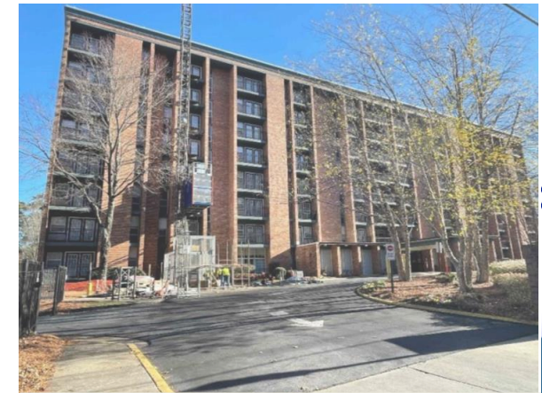
East Lake Highrise 149 Affordable Units | $35,078,085 TDC District 5