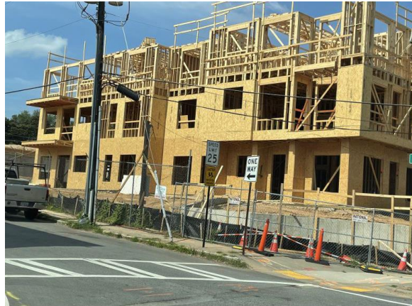
Ashley Scholars Landing II 114 Affordable Units | $64,442,879 TDC District 4