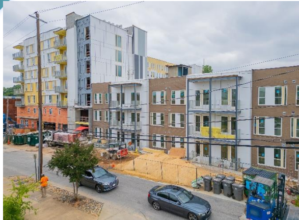
Madison Reynoldstown 116 Affordable Units | $46,300,000 TDC District 5