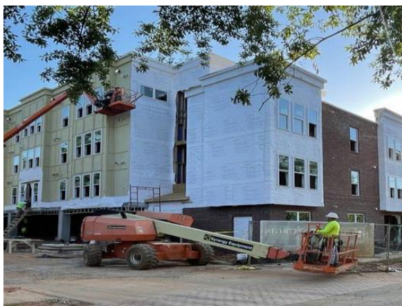
Abbington at Ormewood 42 Affordable Units | $16,588,853 TDC District 4