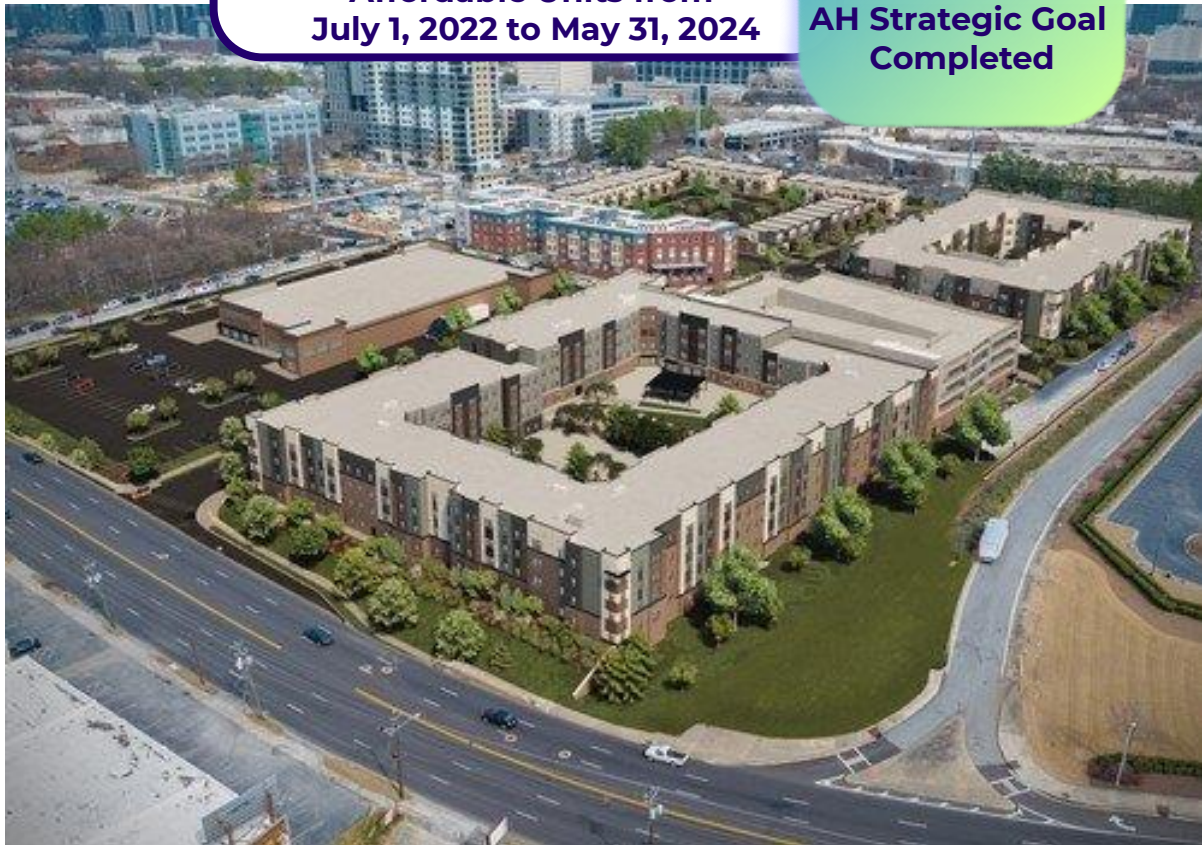
Rendering of Herndon Development