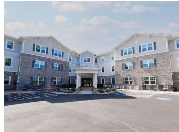
Juanita H. Gardner Village 108 Affordable Units | $25,592,700 TDC District 10