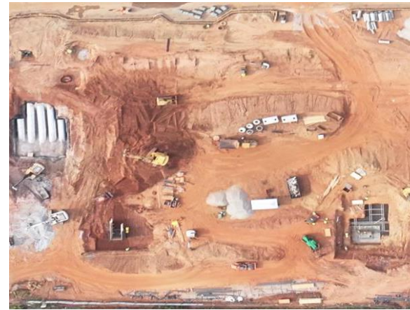
Englewood IB Senior 160 Affordable Units | $70,148,972 TDC District 1