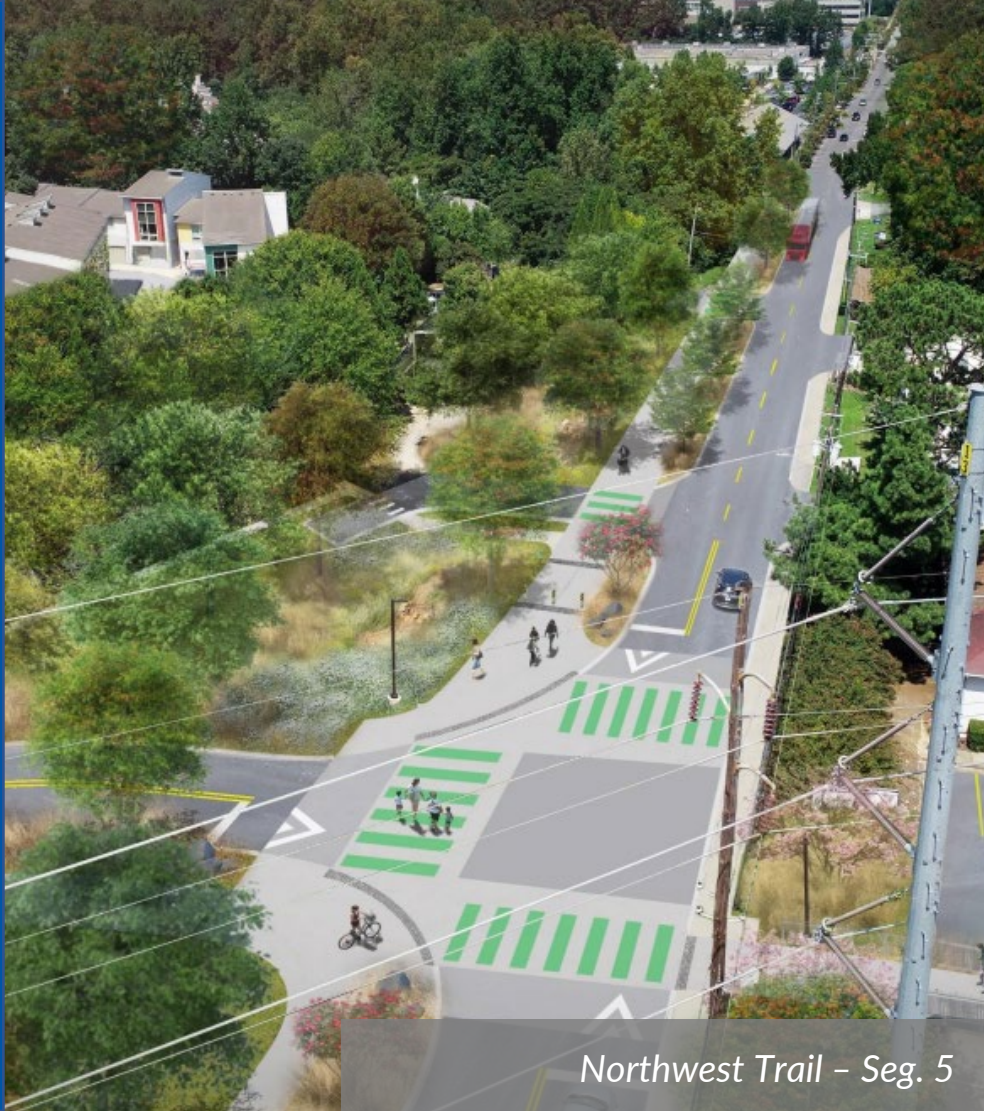
Northwest Trail – Seg. 5