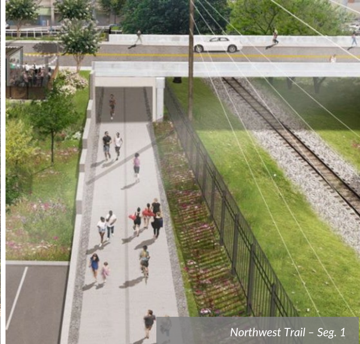
Northwest Trail – Seg. 1