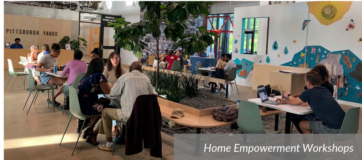
Home Empowerment Workshops