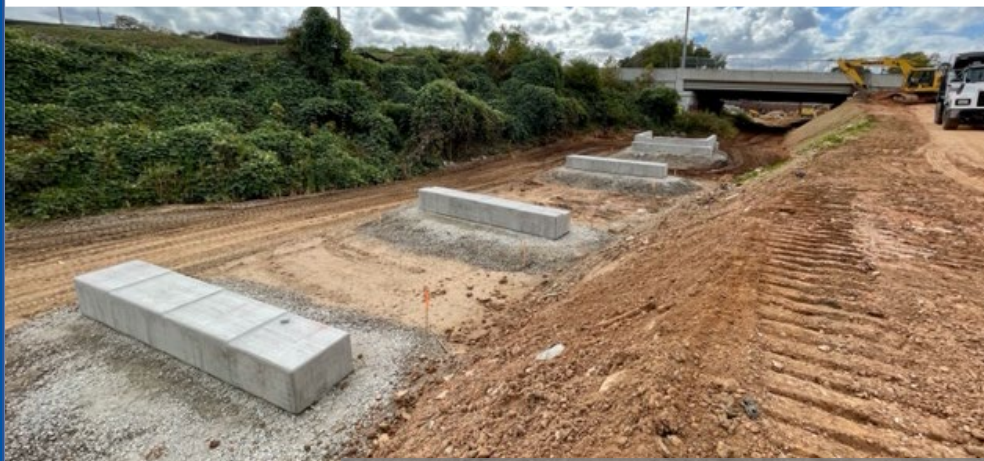
Westside Trail – Seg. 4