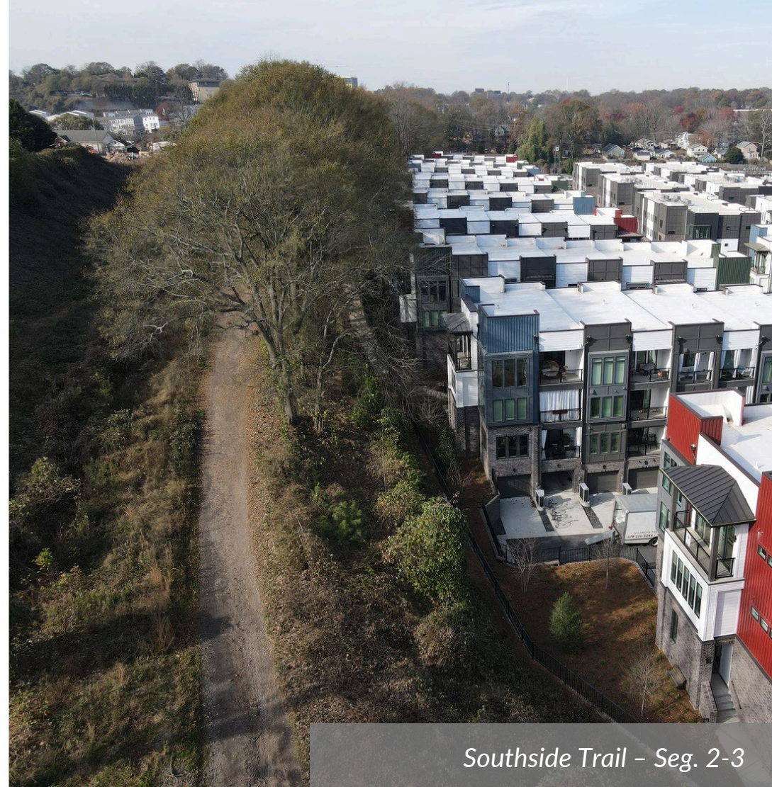
Southside Trail – Seg. 2-3