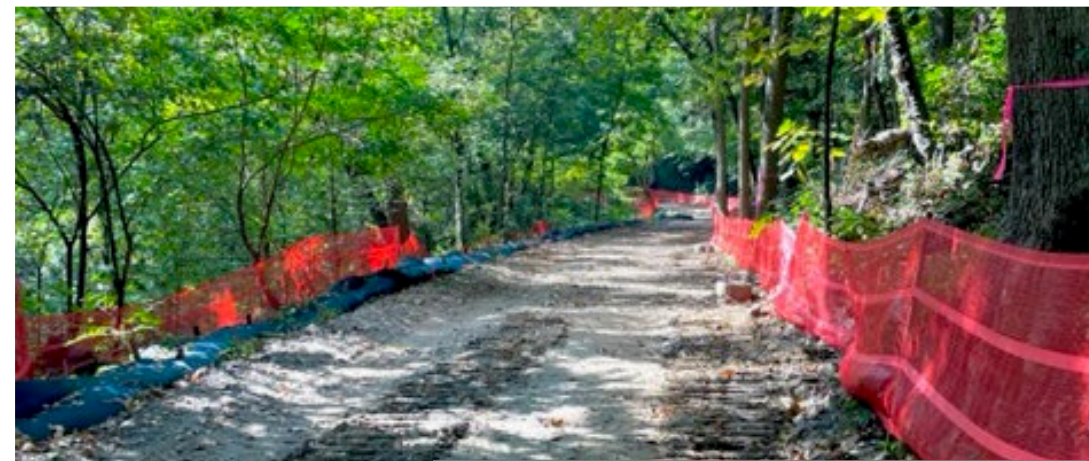
Northeast Trail – Seg. 1