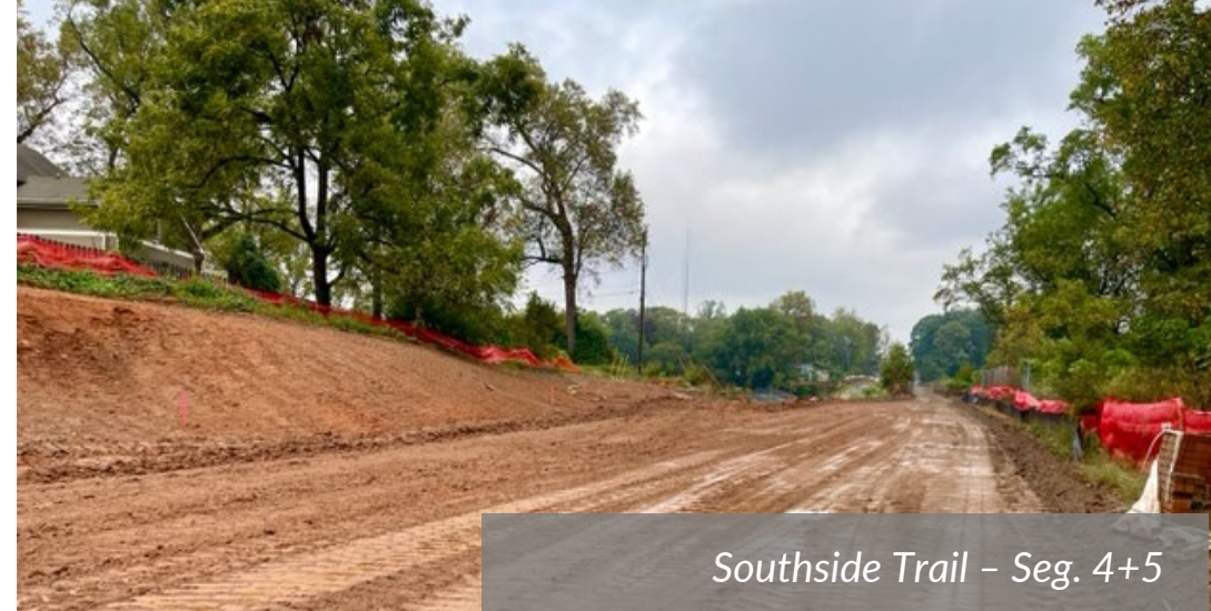
Southside Trail – Seg. 4+5