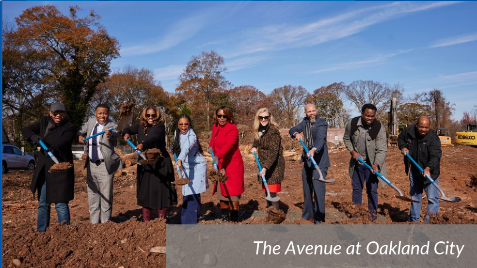
The Avenue at Oakland City

Legacy Resident Retention Program has helped 216 residents