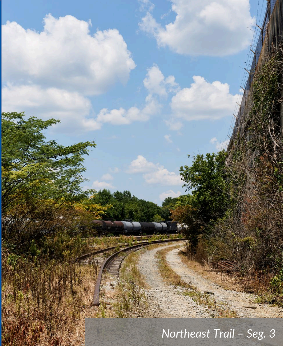
Northeast Trail – Seg. 3