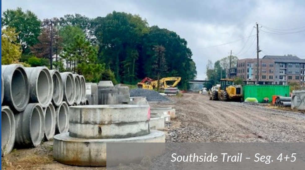
Southside Trail – Seg. 4+5