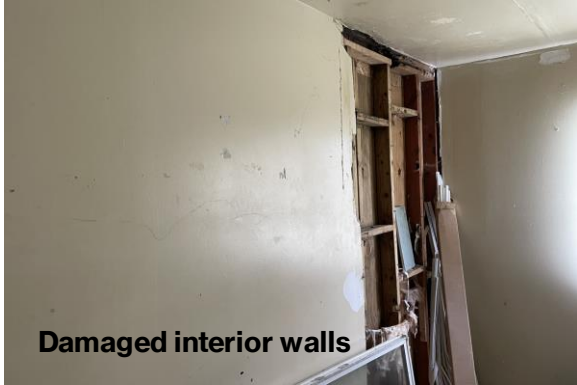
Damaged interior walls