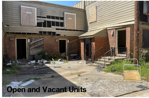
Open and Vacant Units