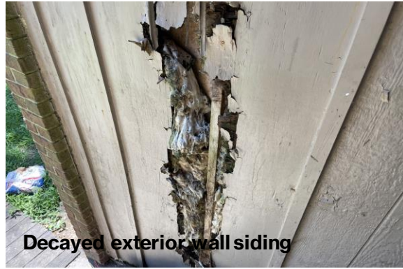
Decayed exterior wall siding