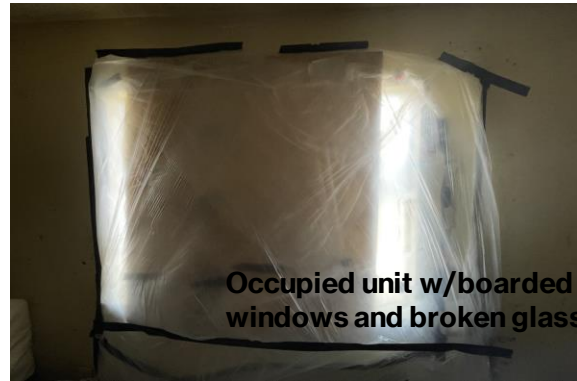
Occupied unit w/ boarded windows and broken glass