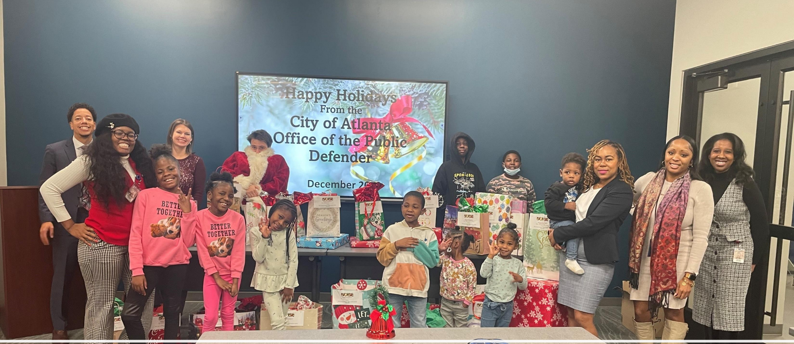
Community Engagement: December Outreach Event