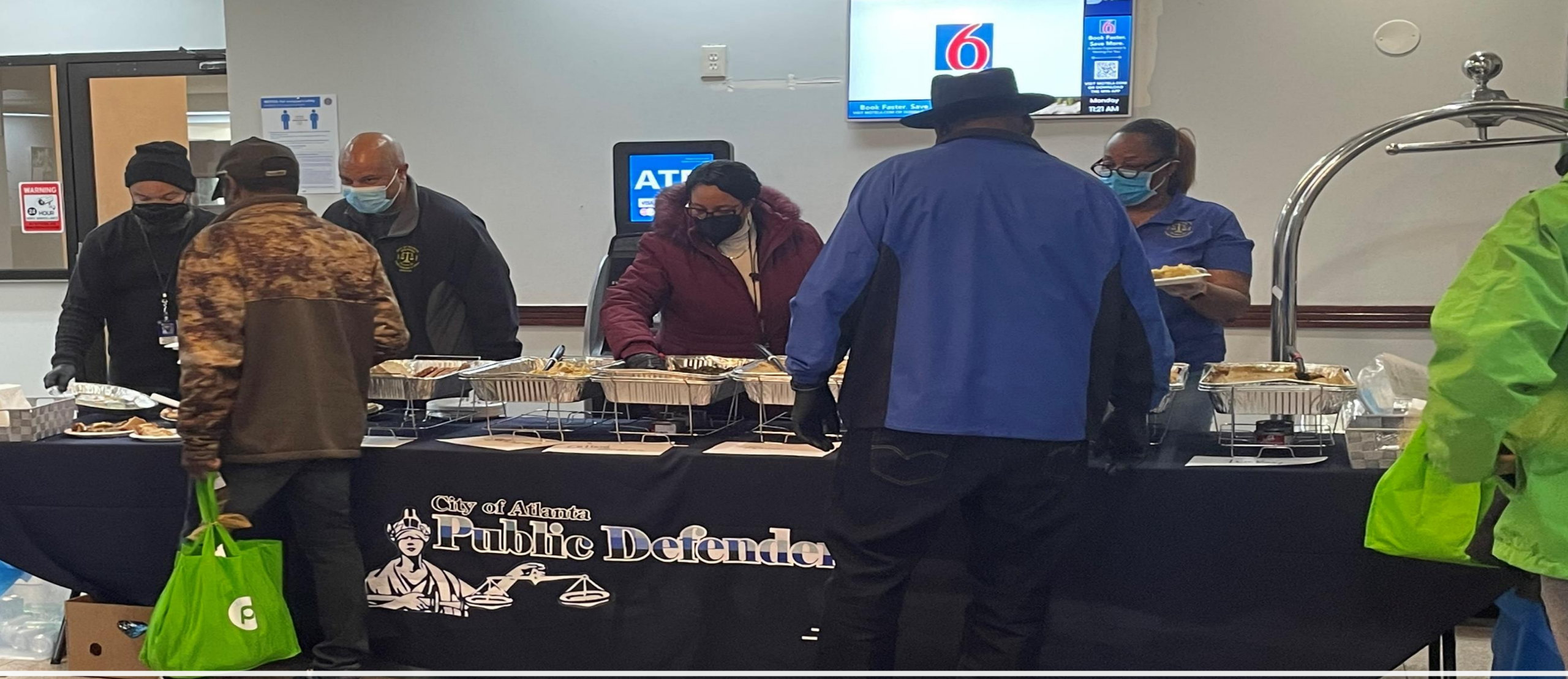
Community Engagement: Annual Thanksgiving Outreach Event