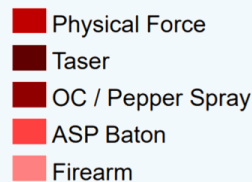
Total Use of Force reports: 615