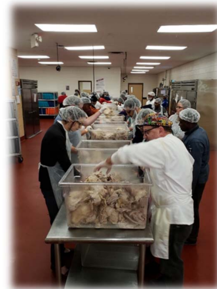
Volunteers prep turkeys cooked by DOC kitchen staff to feed the city's most vulnerable citizens