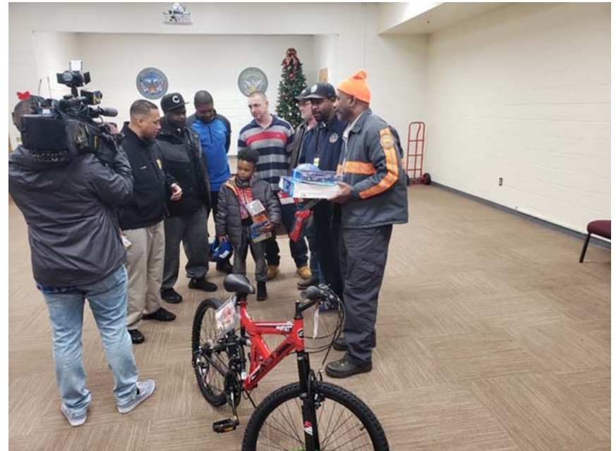
PAT3 residents and graduates pooled their earnings from their respective employment at DWM and DPW to purchase a bicycle and toys for a deserving young Atlantan. WSB-TV covered the story on Christmas Eve 2018.