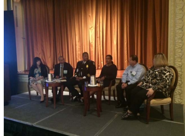
AMWA Panel Discussion: Making a Difference Through Innovative Utility Workforce Programs