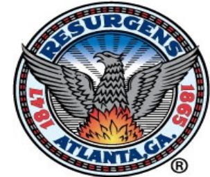
City of Atlanta Office of Housing and Community Development